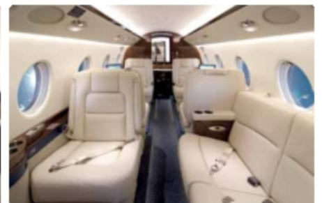
GULFSTREAM G150 > D-CGEP